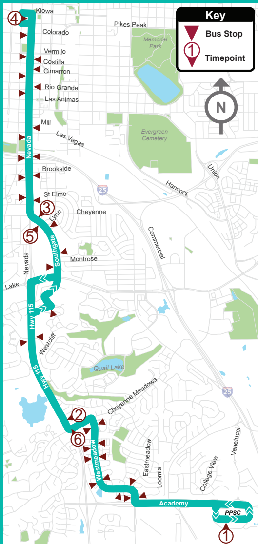
Numbers on map correspond to numbers on schedules.